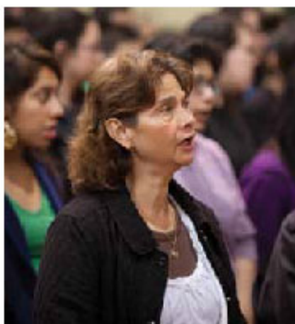
Each member of the body of Christ is needed at the liturgy.

Pope Benedict XVI, in his recent Apostolic Letter, Porta Fidei ("The Door of Faith"), suggests implicitly why it is important for us to participate in Sunday Eucharist. He says, "The 'door of faith' (Acts 14:27) is always open for us, ushering